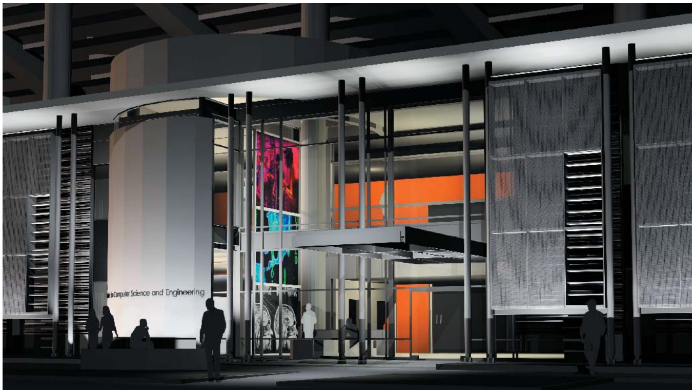
SOUTH VIEW – MAIN ENTRY